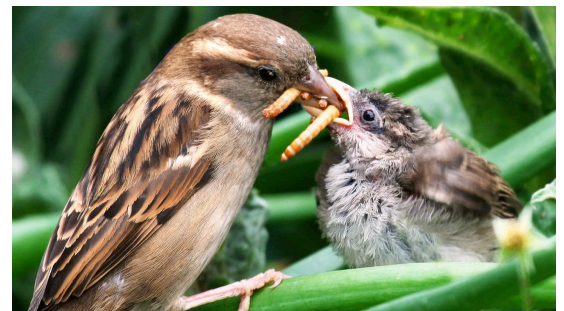
Birds eat up to 550 million tons of insects each year.