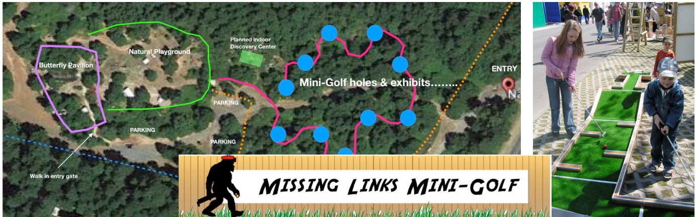
Exhibit draft example